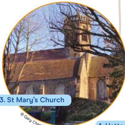
3. St Mary's Church

Situated only a short walk from the Coventry Canal, the town centre has retained much of its unique charm and is steeped in history just waiting to be uncovered.