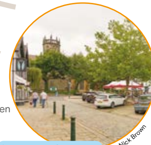
2. Market Square