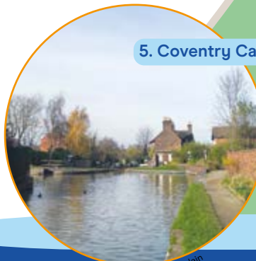
5. Coventry Canal