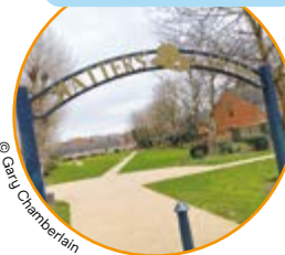
4. Hatters Garden