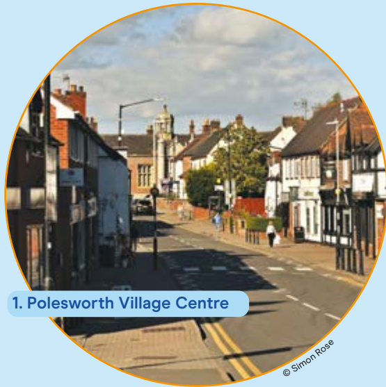
1. Polesworth Village Centre