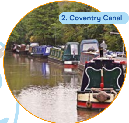
2. Coventry Canal

Enjoy. Volunteer. Donate. canalrivertrust.org.uk