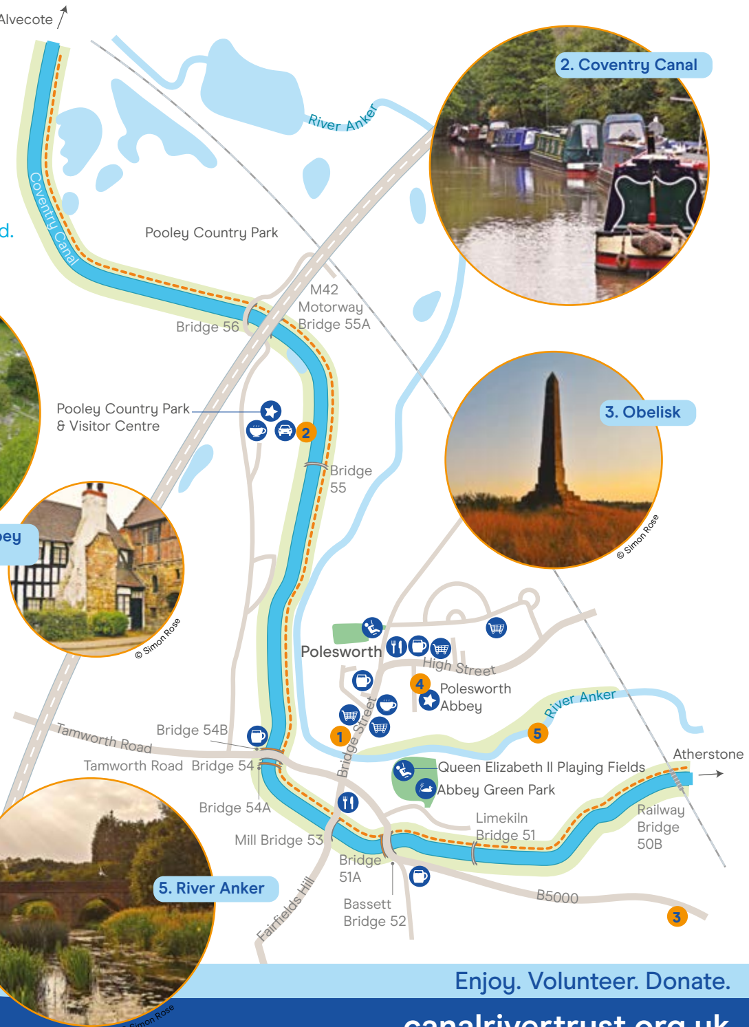
4. Polesworth Abbey and Gateway